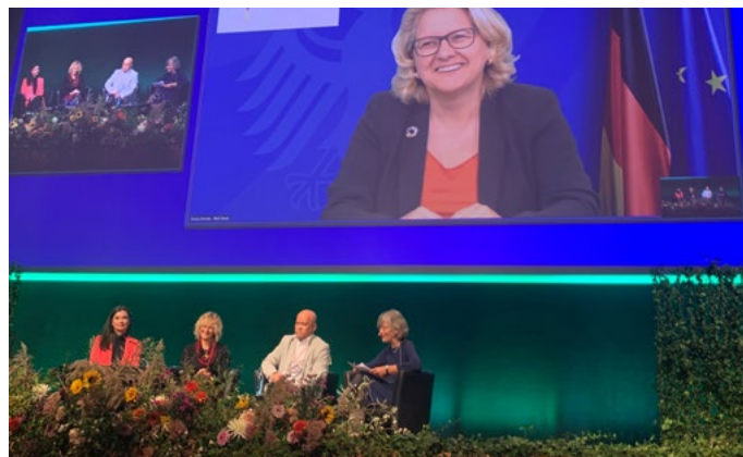
Annual Gathering of German Foundations, Leipzig and joint event of F20 and BMZ (with Minister Svenja Schulze)