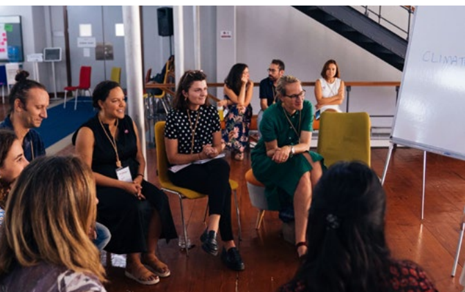
PEX Forum Istanbul 2022, Philanthropy Europe Association