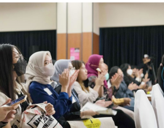
On site audience at the F20 Climate Solutions Forum in Jakarta