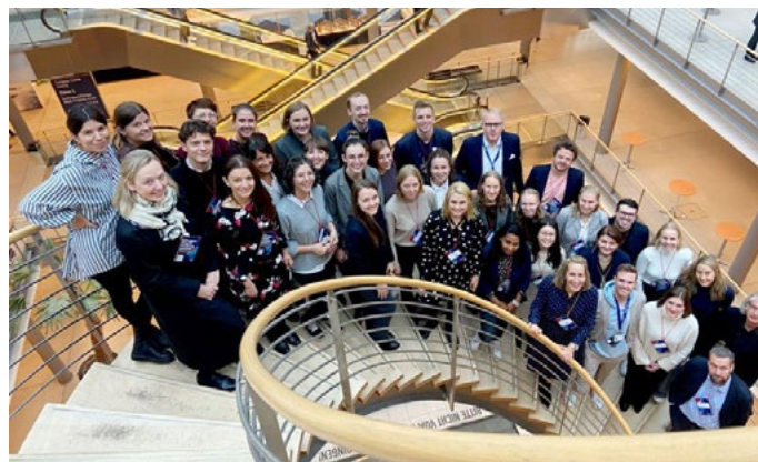
Annual Gathering of German Foundations, Leipzig