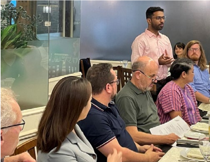
F20 Climate Solutions Dinner at COP27 in Sharm el Sheikh