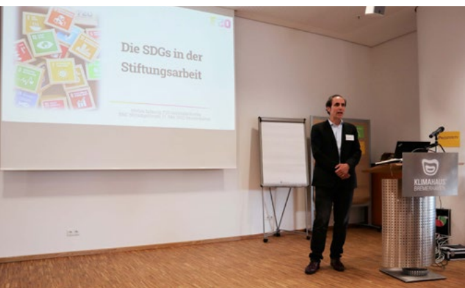
Education for Sustainable Development (BNE) Stiftungsforum 2022, Bremerhaven

This year, we were pleased to meet our partners and attend different events to foster dialogue, exchange perspectives and find synergies in the philanthropic realm and beyond: